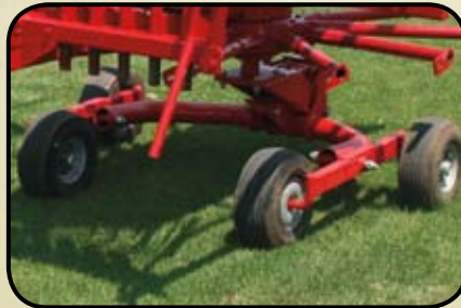
Tandem axle is standard on trailing PTO drive and 3 Pt. hitch.