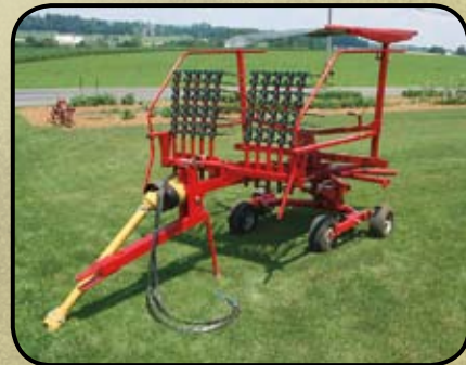
Shown in 3 Pt. hitch in transport position